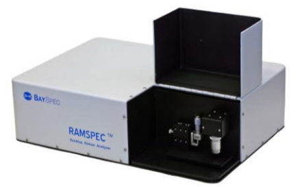
Ramspec-785™ Raman Instrument with Nunavut<sup>™</sup> Deep-Cooled Detectors