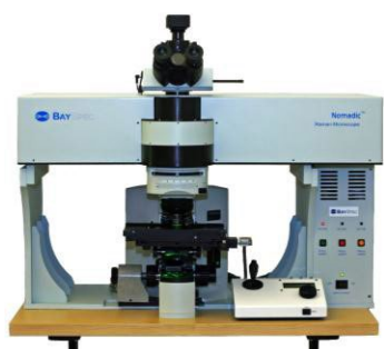
Confocal Raman Microscope equipped with the Nunavut<sup>™</sup> Back-Thinned CCD Detector

Nunavut<sup>™</sup> Series Back-Thinned CCD Detector/Cameras are designed to meet real-world challenges for best-in-class performance, long-term reliability, compact size and ultra-low power consumption. Benefiting from experience manufacturing high-volume optical devices for the telecommunications industry, BaySpec's CCD cameras utilize low-cost field proven components. For the first time in instrumentation history an affordable, accurate and ruggedized spectral device is a reality.