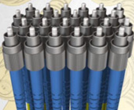
Remove 24 fiber stubs at time