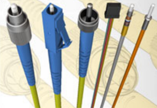
Available ferrule size fixtures: 2.5 - 1.25 - 3.18 SMA - MT - 1.8 & 1.6 Mil Spec