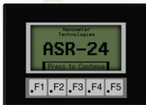
Utilizes touchscreen technology for easy use