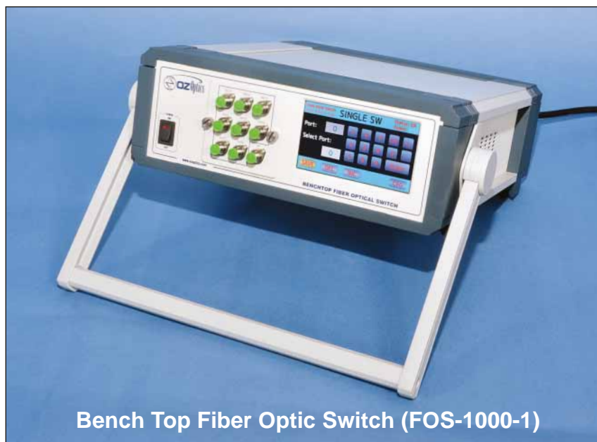
Bench Top Fiber Optic Switch (FOS-1000-1)