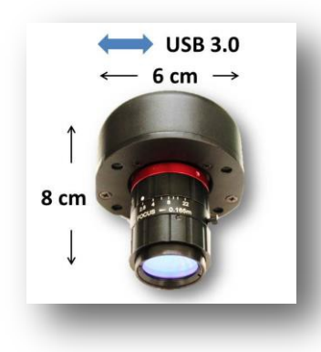
OCI-UAV-1000 hyperspectral camera with an enclosure for gimbal mounting. ~ 180 g.

The OCI™-UAV hyperspectral cameras (OCI is a phonetic spelling of "All Seeing Eye") are designed specifically for use on unmanned aerial vehicles/systems (UAV/UAS), or remotely operated vehicles (ROV). Packed with a high-performance, miniature single-board-computer, they acquire VIS-NIR hyperspectral data with continuous spectral and spatial coverage. Operating of the OCI-UAV is automatic and requires minimal human intervention. The OCI-UAV and powerful package features signification reduction in size (camera head only 8 cm x 6 cm x 6 cm with a computer as compact as 10 cm x 7.5 cm x 3 cm) and weight (up to 320 g total), and faster data transfer rate (up to 120 fps) with automatic data capturing and processing. Unlike conventional hyperspectral imagers which rely on intensive software effort on hyperspectral image cube construction, the innovative design of the OCI-UAV-1000 features "True Push-broom" – imagers can move to scan at random speeds. OCI-UAV-2000 as a snapshot hyperspectral imager fundamentally eliminates artifacts caused motions in flight. These innovations significantly reduce the requirements on UAV system, so that integration is almost effortless for many UAV/ROVs. BaySpec also provides ready-to-fly hyperspectral total solutions. Extreme compactness with uncompromised performance, automatic operation and data processing make the OCI-UAV a straightforward system for applications such as precision agriculture and remote sensing.