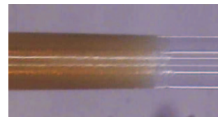
Polyimide stripping: Polymicro 330/300 μm, Polyimide coating shown.