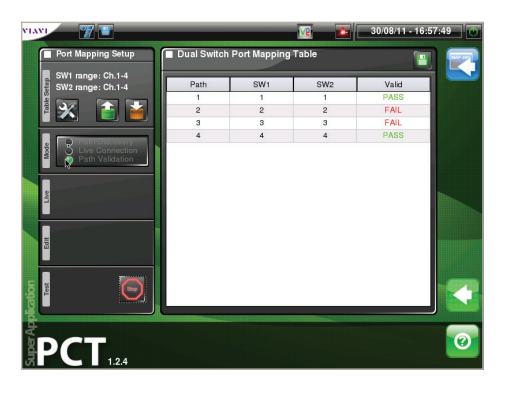
Port mapping (also called continuity or polarity testing) is enabled with two optical switches