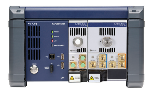
PCT solution with mORL modules that cover all three fiber types

Instrument mode lets users quickly and easily access all the key setup parameters in a simple easy-to-use intuitive GUI, which is ideal for R&D and qualification labs. This feature gives users maximum control in a rapidly changing environment. Users have constant access to interactive windows showing current connections and measurement setups. Quick-save features let users save test results to text files and window settings to simplify recall.