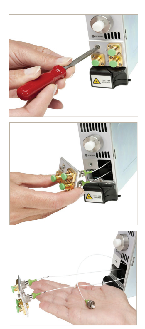
Step-by-step example of opening the front panel door to maintain the launch connectors