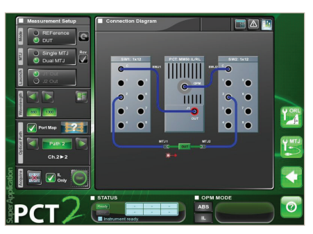
Example screen shots from the PCT application framework. Simple results views and real time connection views simplify use.