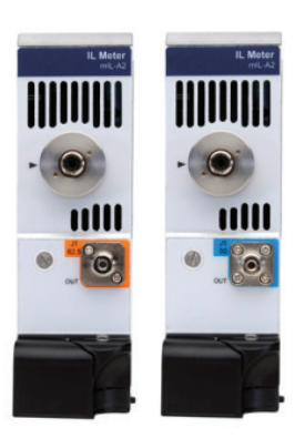
mIL-A2 modules: One for 50 µm fiber (OM3) and another for 62.5 µm fiber (OM1)

For manufacturing applications, maintaining equipment with minimum downtime is critical to profitability. The mORL-A1, mIL-A2 module, and the MAP-200 were designed with this critical need in mind. An industry-unique feature for modular platforms is the access the mORL/mIL provides to optical connectors. As the figure below shows, removing only one screw provides full access to the bulkhead connector.