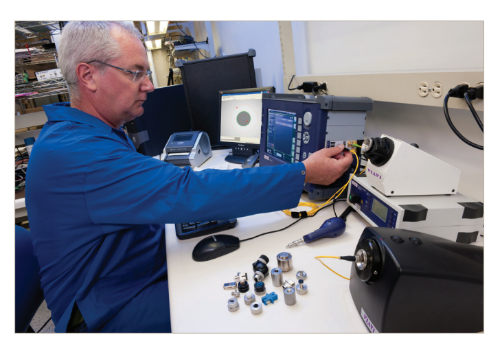
A typical connector test bench would include the VIAVI solutions for IL and RL plus connector inspection