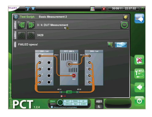
Screen shots from the onboard script mode for production testing