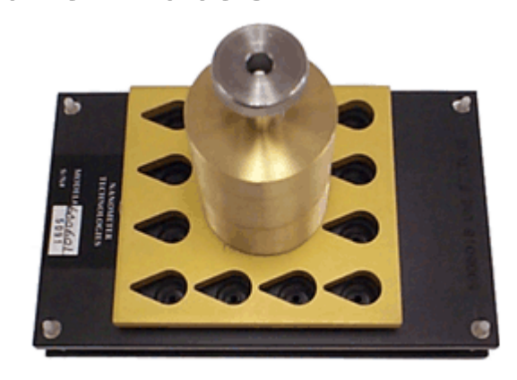
UNI-12 Fixture Plate

The UNI Fixture Plates are easy to use and are very low in maintenance. These fixture plates require no calibration and are ready to go out of the box.