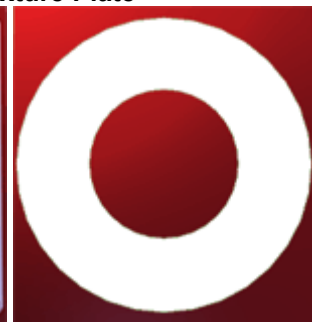
Lapping Film from circular polishing machines.