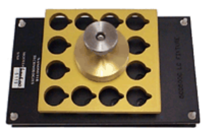
LC & MU - 12 position