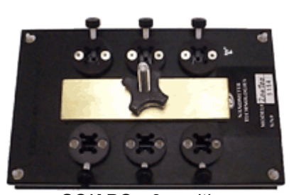
SC/APC - 8 position