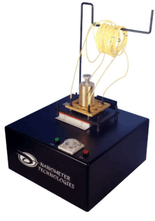
Figure 8 Polishing:

If you're on a budget and need a high quality polisher, the MCP 12 is made for you. The MCP 12 is incredibly easy to use with a very small learning curve so you won't lose valuable production time. With exclusive figure 8 polishing, universal fixture plates, and low consumable costs this machine will quickly become an asset to your company.