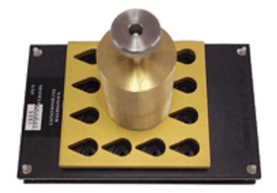
UNI-12 - 12 position FC / SC / ST / ESCON / FDDI / DIN most 2.5mm ferrule