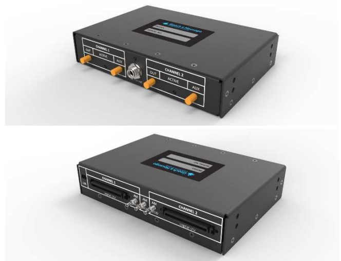
Front and rear view